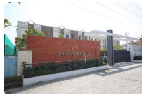
The Sun School