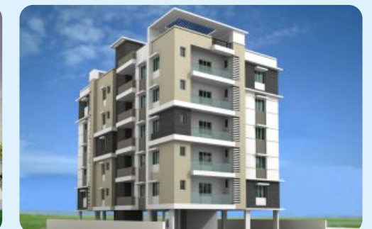
Satya Usha Grand

NOTE: This brochure is only a conceptual presentation and not a legal offering. The promoters reserve the right to alter and make changes in elevation, highlights, plans and specifications as deemed fit.