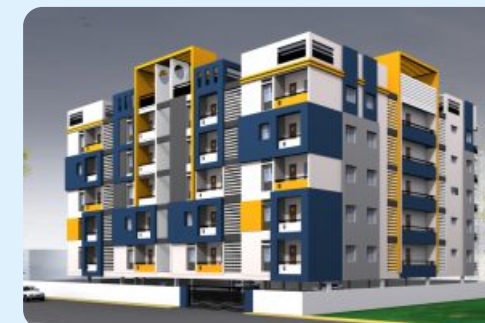
Satya Green County