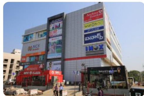
NCS Multiplex & Mall