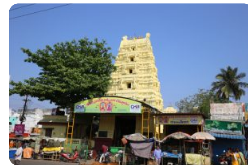
Goddess Paiditali Temple