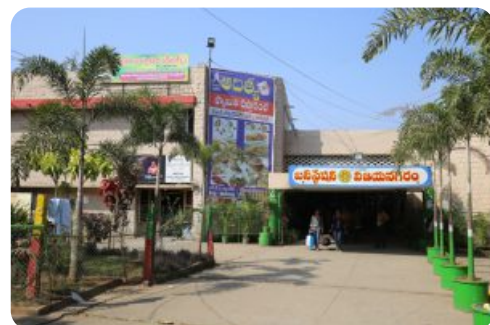
APSRTC Bus Stand