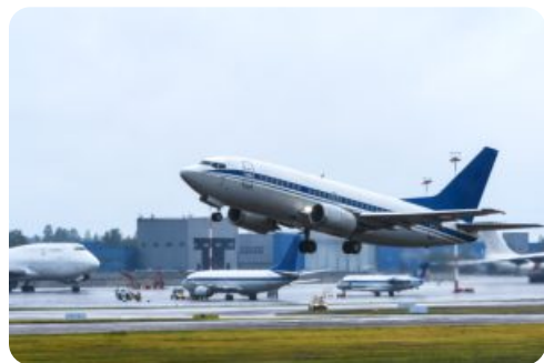
Proposed Bhogapuram Airport