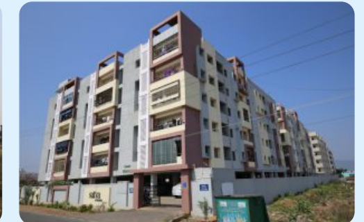
Satya Green Heights