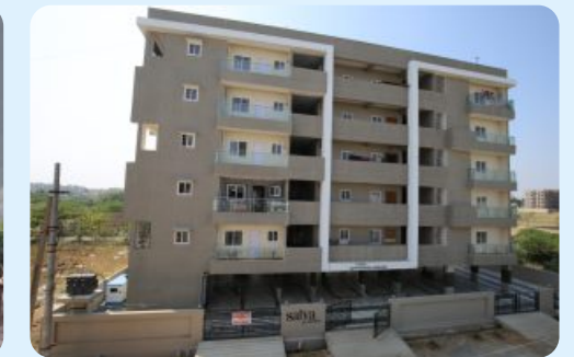
Satya Annapurna Heights